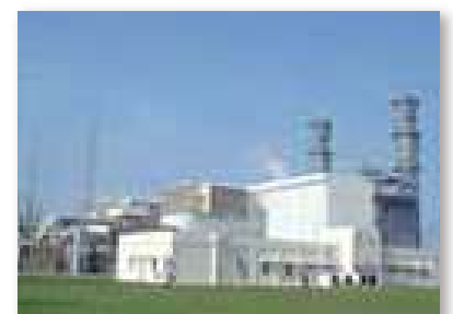
Phu My 3 Power Station in Vietnam which started its commercial operation

We have been working in cooperation with Sojitz Corporation to support Kyushu Electric Power Co., Inc. in developing overseas projects.