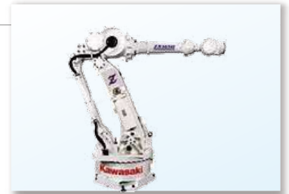
Welding robot produced by Kawasaki Heavy Industries Ltd.

We are acting as a sales agent along with Sojitz Machinery Corporation for welding/painting robots by Kawasaki Heavy Industries Ltd. and die-casting machines by Ube Machinery Corporation, Ltd. for Toyota Motor Kyushu, Inc. We are contributing to the automobile production in their Miyata Plant, Kanda Plant and Kokura Plant.