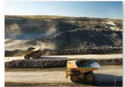
The open-cut operation site in Minerva coal mine in Australia, in which Sojitz Corporation holds a 96% interest

Cooperating with Sojitz Corporation, we are supplying Kyushu Electric Power Co., Inc. with nuclear fuel, coal, heavy oil etc. as energy sources for electric generation. Japan is poor in natural resources and dependent on foreign countries for them. In such a situation, we are taking full advantage of the global network as one of the strengths of trading companies in order to ensure a long-term stable supply of energy.