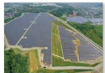
The solar power plant which is operated by Mirai Soden Kami-Mio Corporation (Ownership: Sojitz Corporation – 42%, Sojitz Kyushu Corporation – 18%)

The promotion of renewable clean energies are imperative need for us to cope with the global warming which is one of the critical issues all the people on earth have to contemplate. Regarding it as a crucial request from our society, we are diligently working on the business field of renewable energies, such as solar energy, wind power, and biomass energy.